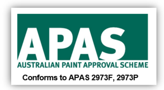
Image 1: An example of an APAS mark referring to specification subclasses of certification.